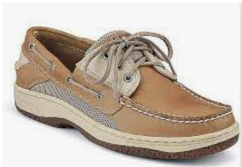
Tan Suede Buck